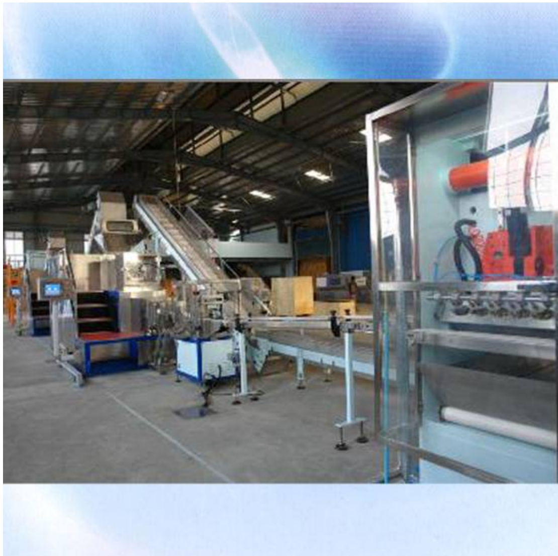
Detailed Product Description

11、 Finishing lines with capacity of 500 to 4,000 kgh in Series ES