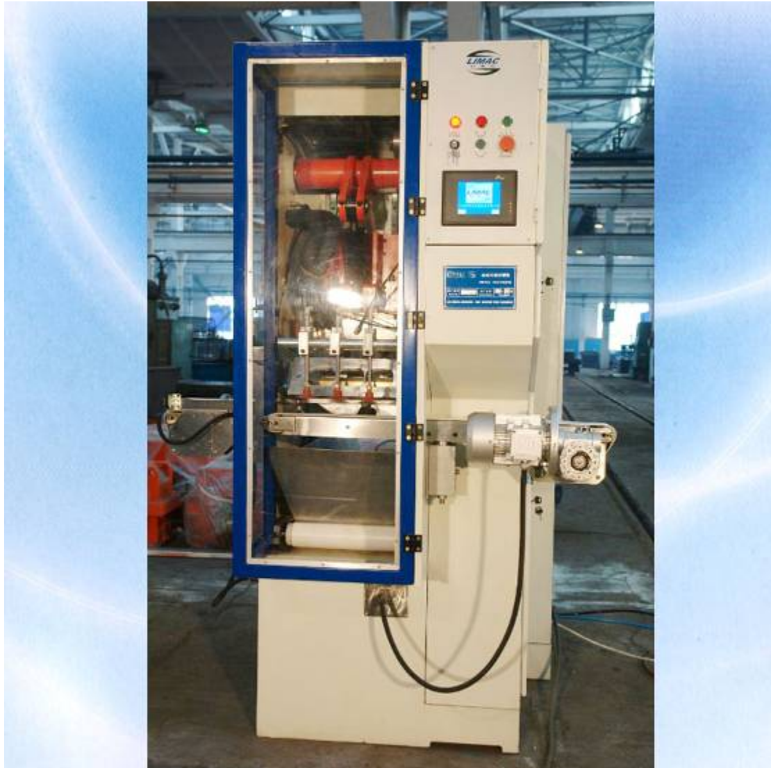
17、 The configuration of finishing lines with capacity of 500 to 4,000 kgh in Series ES]

Frequency adjustable A.C. drive, servomotor, servo controller, and PLC by Allen-Bradley, USA; 16、 STAMPER for toilet,transparent soap MFS-3